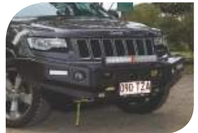
EXPLORER & FRONTIER

The Explorer bar is fitted with a strong steel channel and a single polished alloy or steel loop over the grille, whereas the Frontier bar utilises the same strong channel but without the centre loop. This style adds a smart finish to any vehicle as well as ensuring peace of mind for the safety of the vehicle and its occupants in the event of an animal strike.