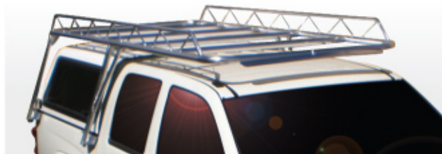
Dual Cab Well Body MR AL07

Heavy duty commercial rack that has no side rails allowing greater load carrying flexibility for items such as gyprock sheeting. Strong tie down rails.