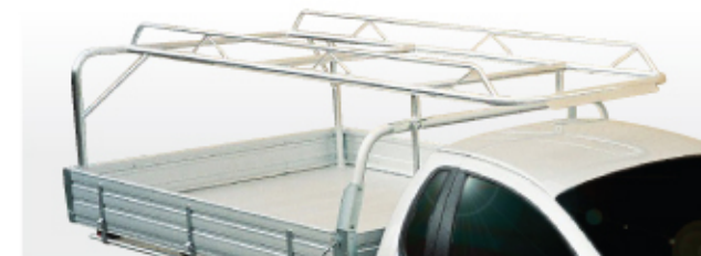
Tray Back Single Cab MR AL02

Heavy duty commercial rack that runs from rear of vehicle to the windscreen. Available for both drop side well body utes.