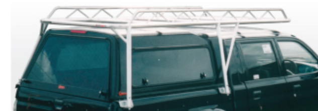
Over Fibreglass Canopy

Peaked centre assists water run off and rear mounting uprights profiled so canvas fits flush with outside of tray. Specially rolled corners on each side provide a gentle curve which protects the canvas from unnecessary wear and tear and give a quality profiled appearance. Can be built to take convenient load carrying cross bars or the maxiRACK as shown on this brochure.