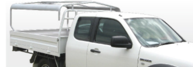
Profiled Canopy Frame CF 01

Heavy duty commercial rack runs from rear of the vehicle to windscreen. Is engineered to support cab overhang so no attachment to cab is required. Available for both drop side and well body utes. The design allows for independent movement of cab and tray.