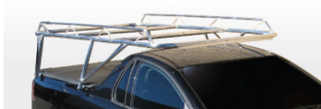
Single Cab Well Body MR AL01

maxiRACK is structurally designed for the heavy duty end of the industry. Expert design and cleverly engineered bracing principles reduce the overall rack weight, maximising it's carrying capacity.