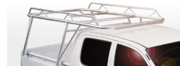
Well Body Dual Cab MR AL03

Very heavy duty commercial rack made from steel or aluminium. Rack runs from rear of the vehicle to front of the windscreen. Available for drop side well body utes.